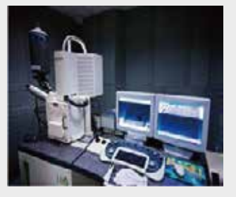
EM energy spectrum analysis